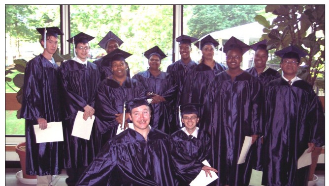
Career College Graduates, ACC, 2010

We value your readership and support for education.